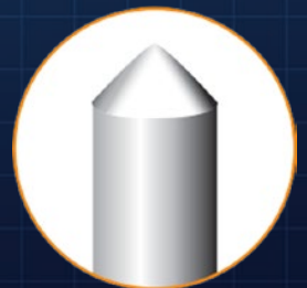
TechSmart™ Chamfered Pin

TechSmart™ went beyond matching the OE parts in fit, form, and function. They added chamfered pins which allow for a streamlined, seamless installation because they make it much easier to connect the wiring harness to the actuator. Without the chamfered pins, the connection has to be perfectly in line with the actuator to fit.