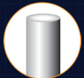
Competitor Flat Pin